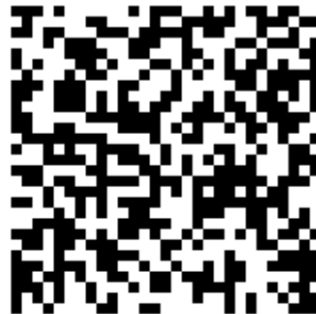
Figure 1. Graphic Display of the Life Game

We compile the new definition by pressing c-sh-c . The next time we play the Life game, the gameboard appears as in Figure 1.